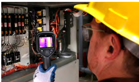
Variable emissivity and reflected temperature parameters give you reliable results fast