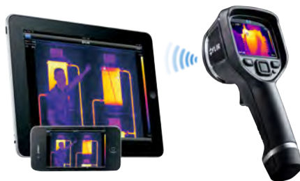
Wireless connectivity to smartphones, tablets and more.

*After product registration on www.flir.com