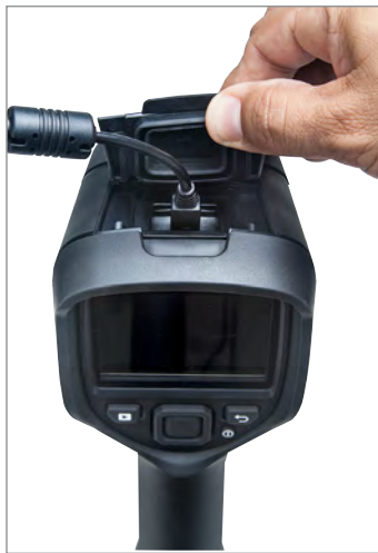
Download images fast via USB.

Specifications are subject to change without notice. For the most up-to-date specifications, go to www.flir.com