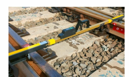
The gauge measures the following parameters:

Track gauge Super-elevation(cant) Check rail gauge Back to back distance Flangeway clearance