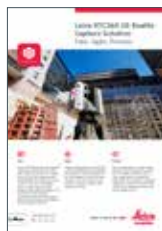
Leica RTC360 Data Sheet

Copyright Leica Geosystems AG, 9435 Heerbrugg, Switzerland. All rights reserved. Printed in Switzerland – 2021. Leica Geosystems AG is part of Hexagon AB. 957530en – 11.21