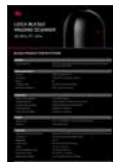
Leica BLK360 Data Sheet