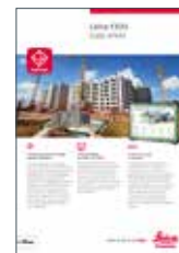
Leica CS35 Data Sheet