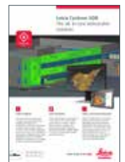
Leica Cyclone 3DR Data Sheet

Leica Geosystems AG Heinrich-Wild-Strasse 9435 Heerbrugg, Switzerland +41 71 727 31 31