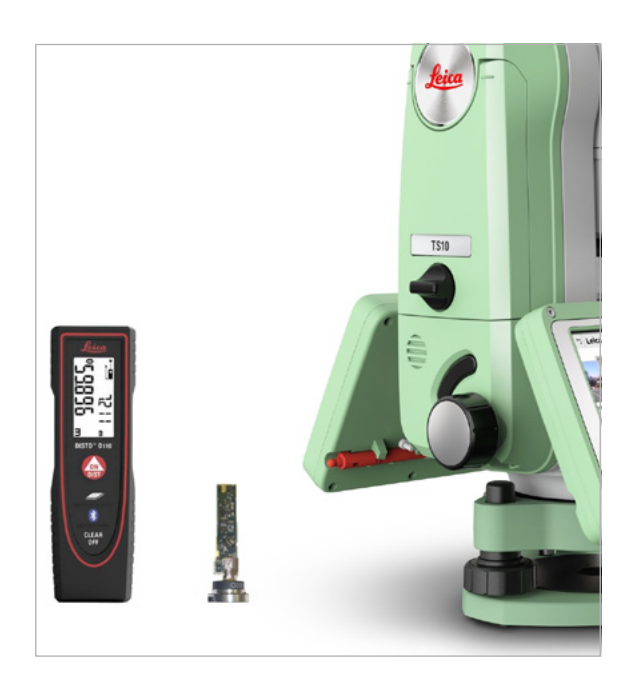
Figure 2 – Illustrating the downsizing challenge. Leica Geosystems' smallest DISTO D110 (left), AutoHeight module (middle), TS10 (right).