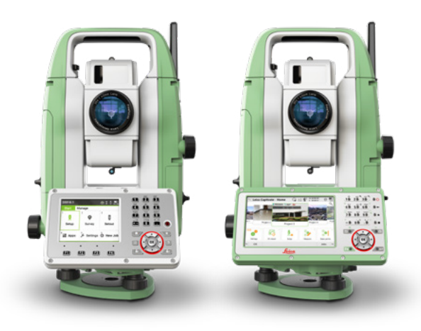
Figure 1 – Leica Flexline TS07 and TS10. World's first total stations with integrated instrument height measurement.

With the release of the Leica FlexLine Series TS03, TS07 and TS10, Leica Geosystems provides not only a new range of reliable, long-lasting and high-quality manual total stations but also introduces AutoHeight – an innovative functionality for getting the instrument height with a simple button press. The AutoHeight functionality is available in the Leica TS07 and TS10.