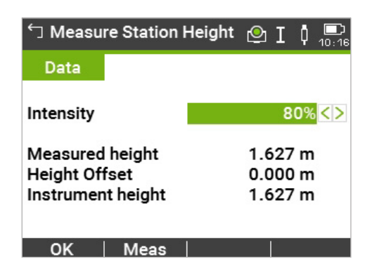
Figure 4 – Example of the FlexField panel for measuring the height on the Leica FlexLine TS07.