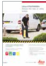
Leica UTILIFINDER+ Flyer

Illustrations, descriptions and technical data are not binding. All rights reserved. Printed in Switzerland – Copyright Leica Geosystems AG, Heerbrugg, Switzerland, 2015. 842508en - 12.15 - INT