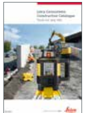
Construction Tools Catalogue