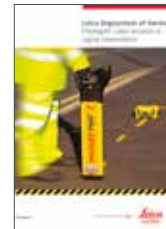
Leica Digicat xf-Series Brochure