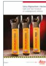
Leica Digicat i-Series Brochure