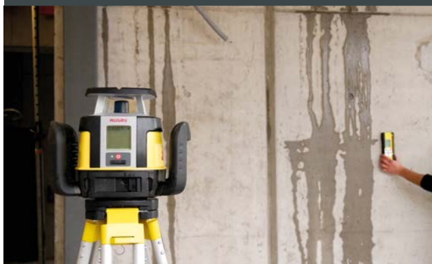
HORIZONTAL ONE-BUTTON LASER