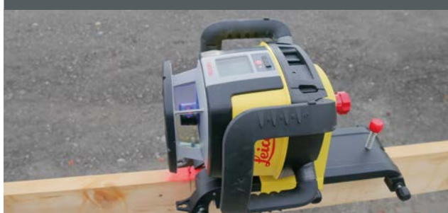
HORIZONTAL, VERTICAL & MANUAL SLOPE