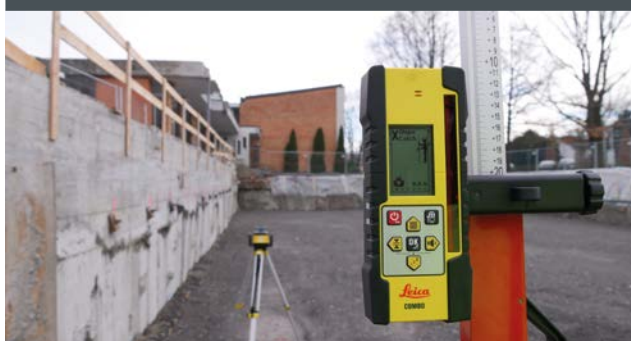
HORIZONTAL & SLOPE LASER