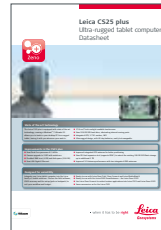
Leica CS25 plus