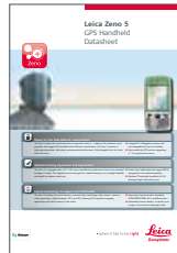
Leica Zero 5

Microsoft, Windows® and the Windows logo are either registered trademarks or trademarks of Microsoft Corporation in the United States and / or other countries.