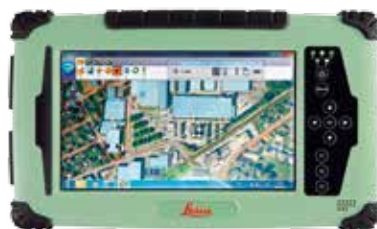
CS25 - ALL VARIANTS