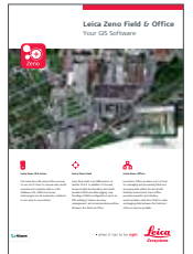
Leica Zero Field & Office