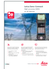
Leica Zero Connect