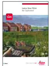
Leica Viva TS16